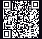
RUT950 360° VIEW